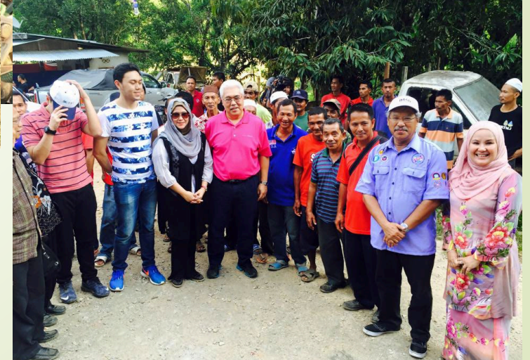
4. Volunteer program – flood victim 2014