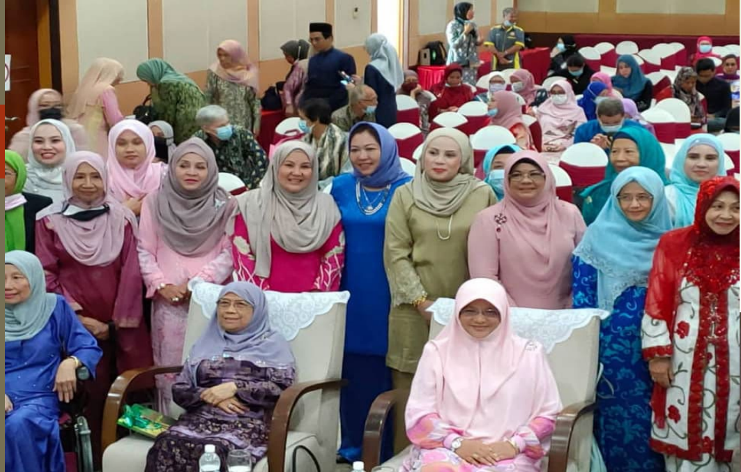
Tokoh Wanita Kelantan