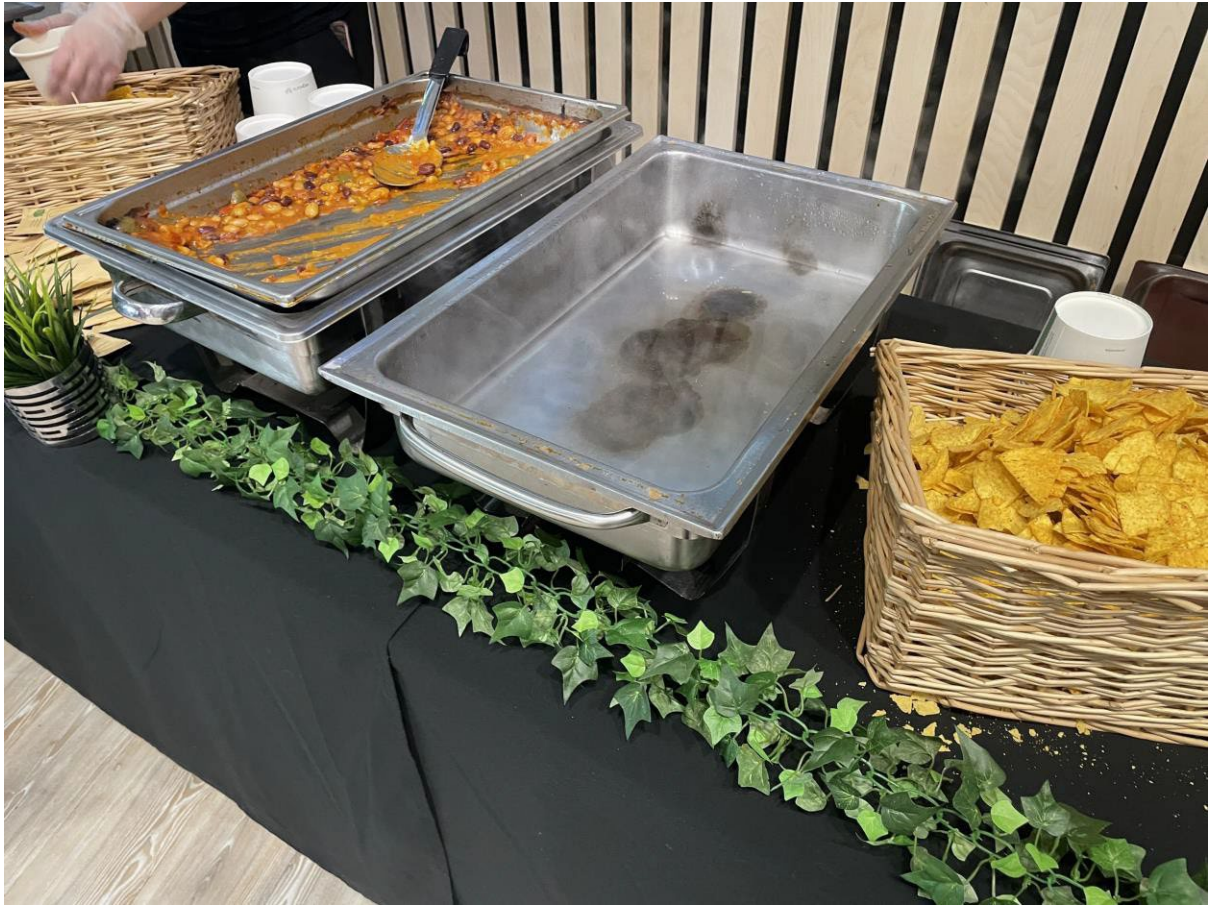
6 - Half meat /half vegan food