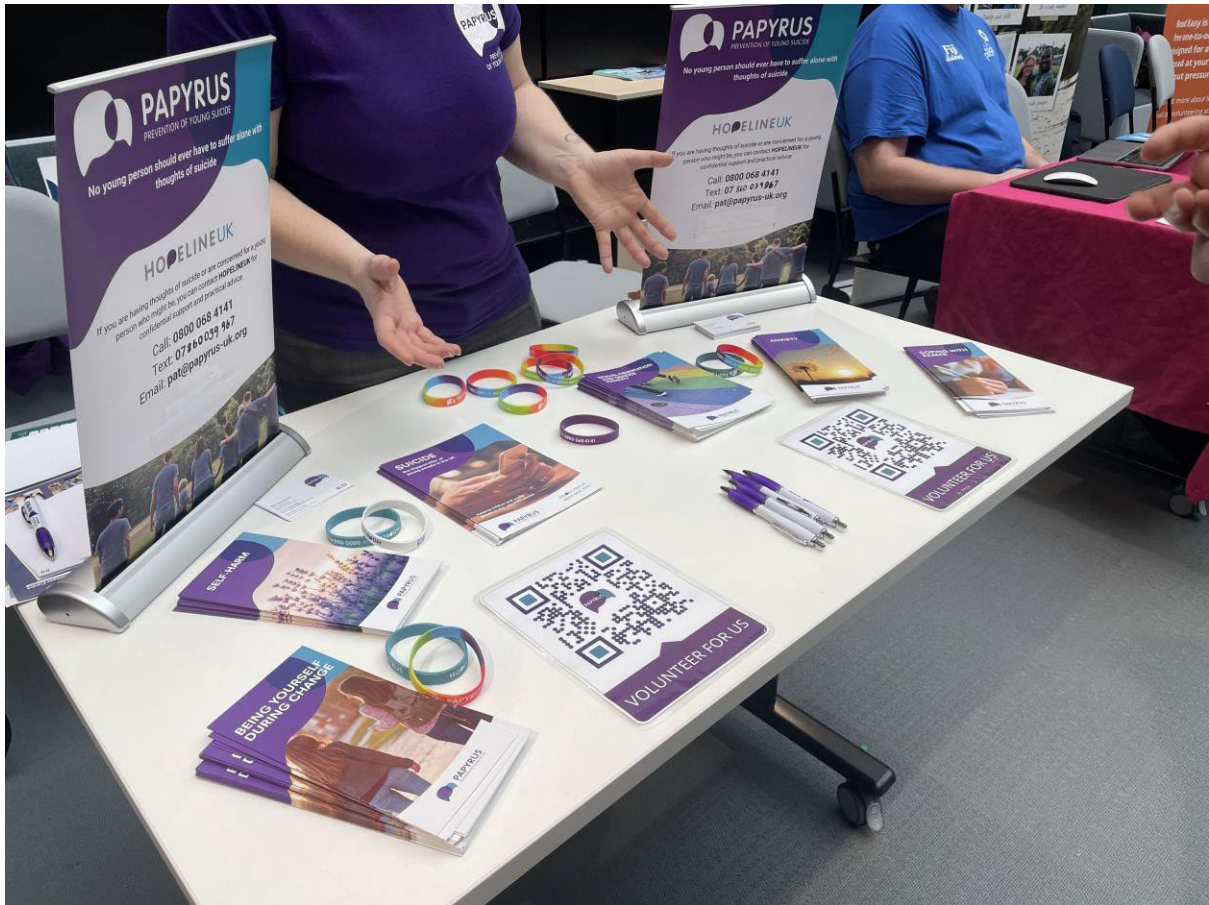
11 - Plastic bands