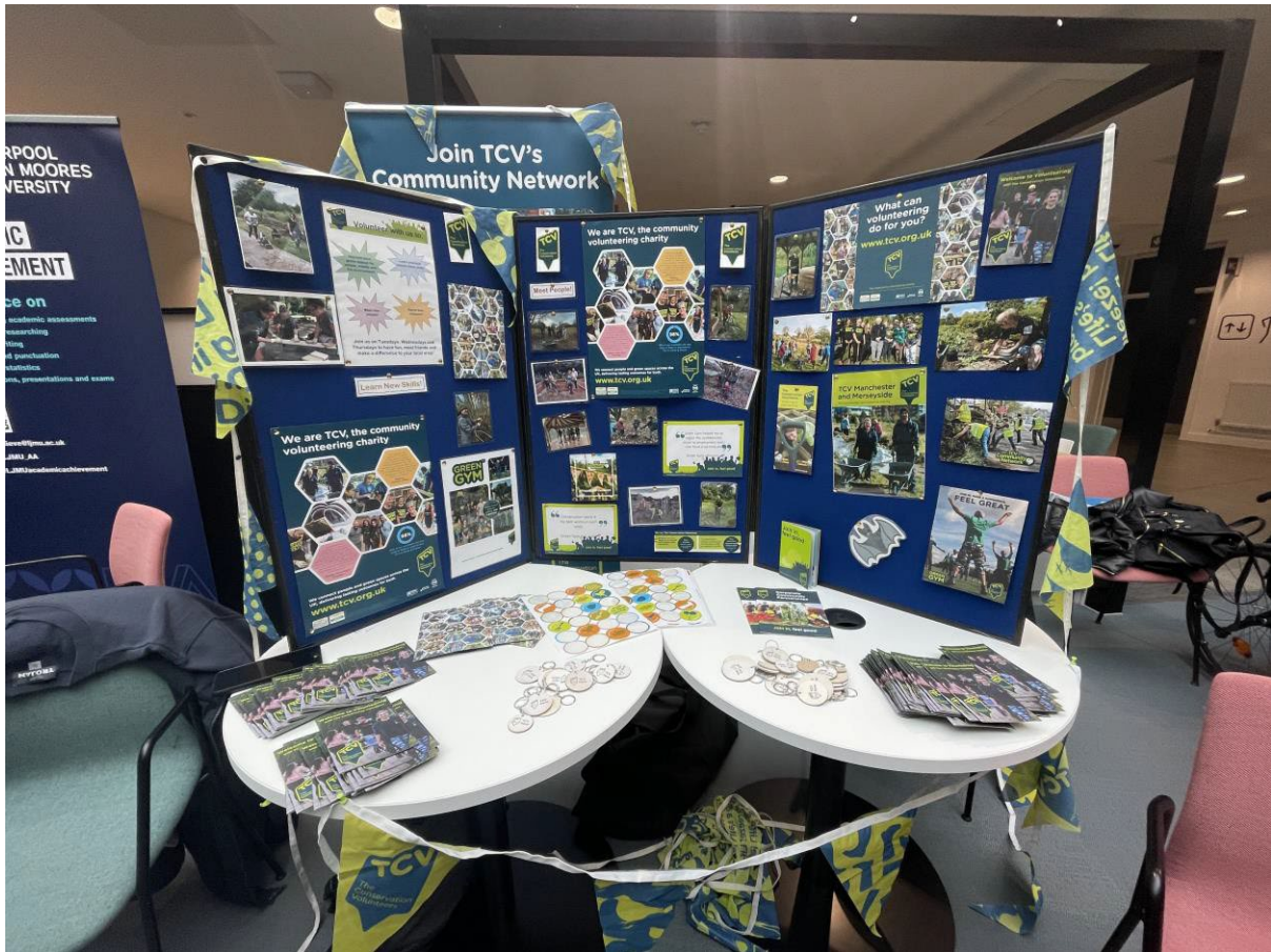
14 - Green theme