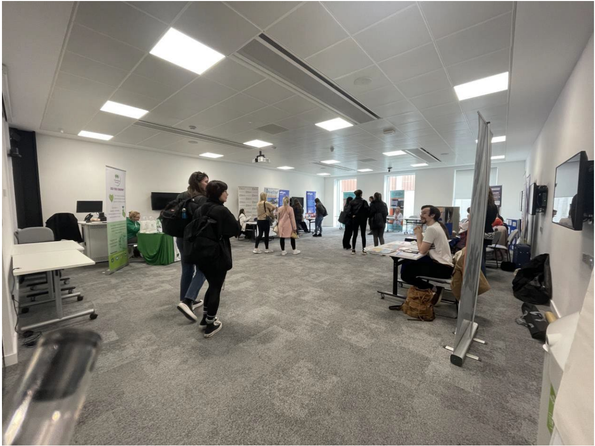
2 - Some of the stalls