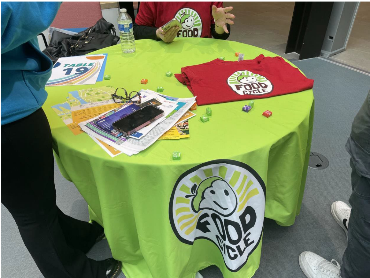
9 - Stall layout