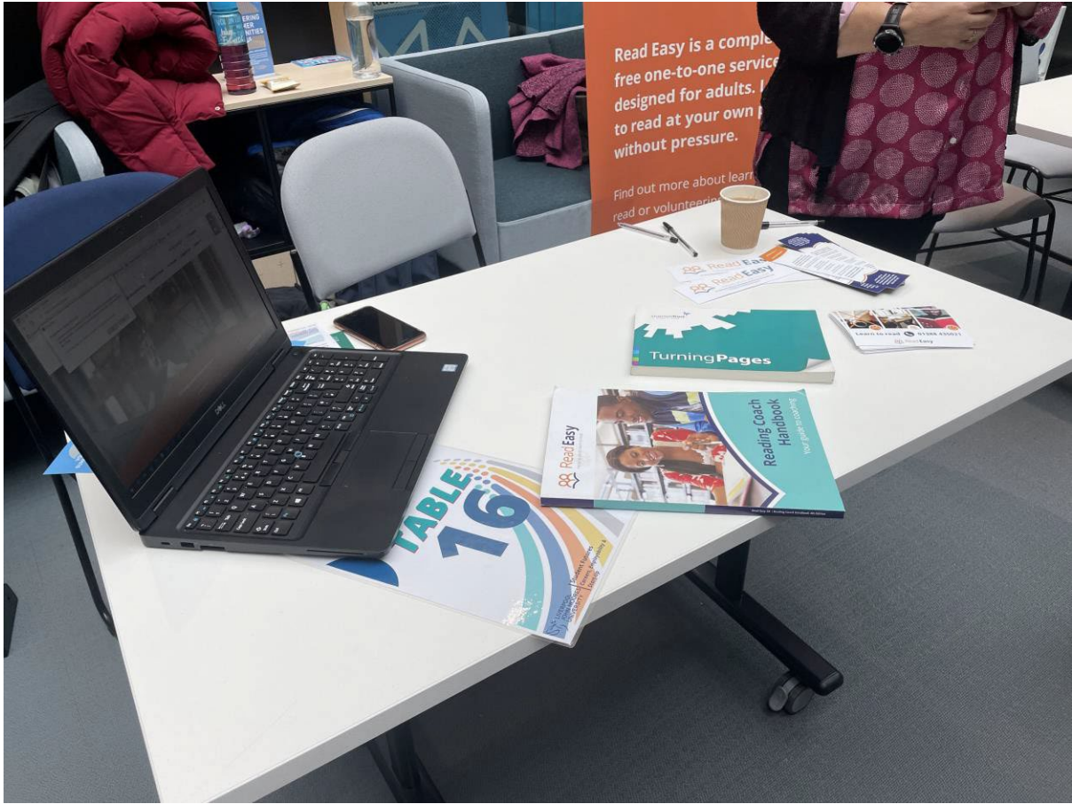
10 - Stall layout