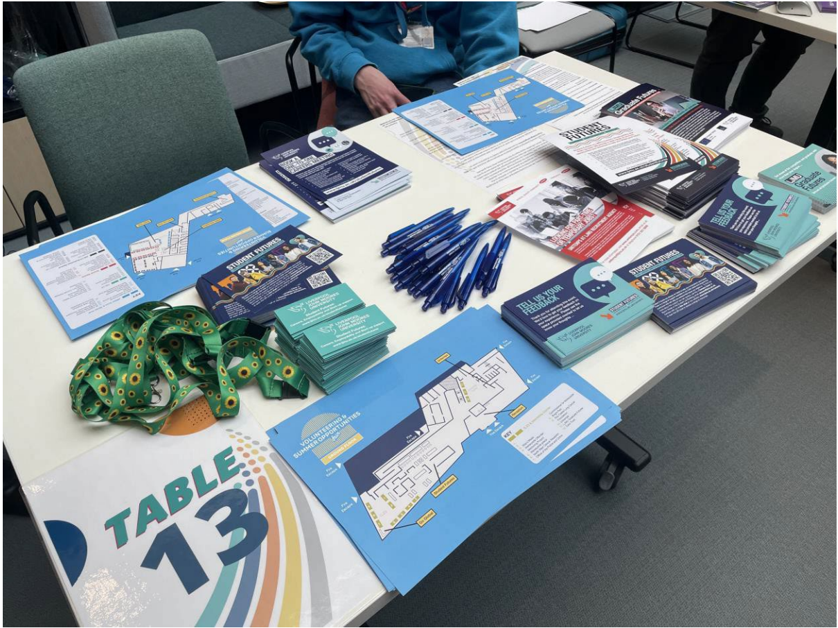
12 - Plastic pens