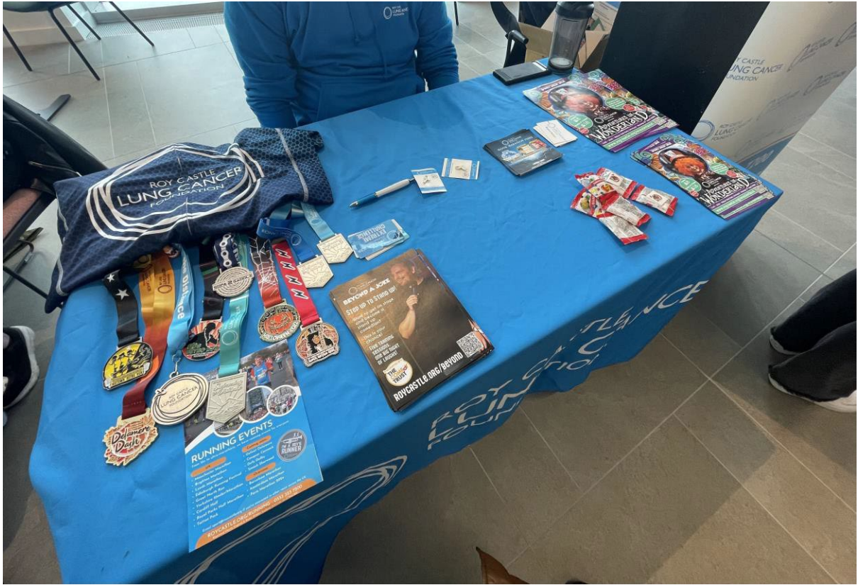
8 - Stall layout