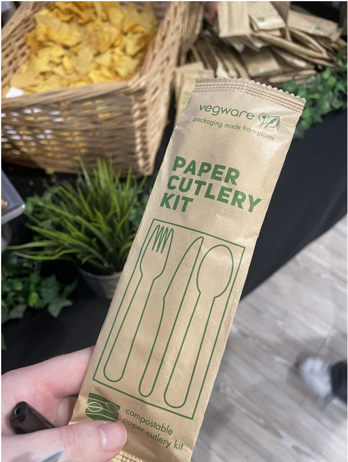
5 - Paper cutlery