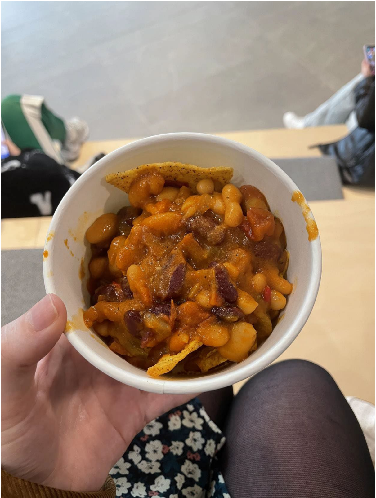
7 - Food