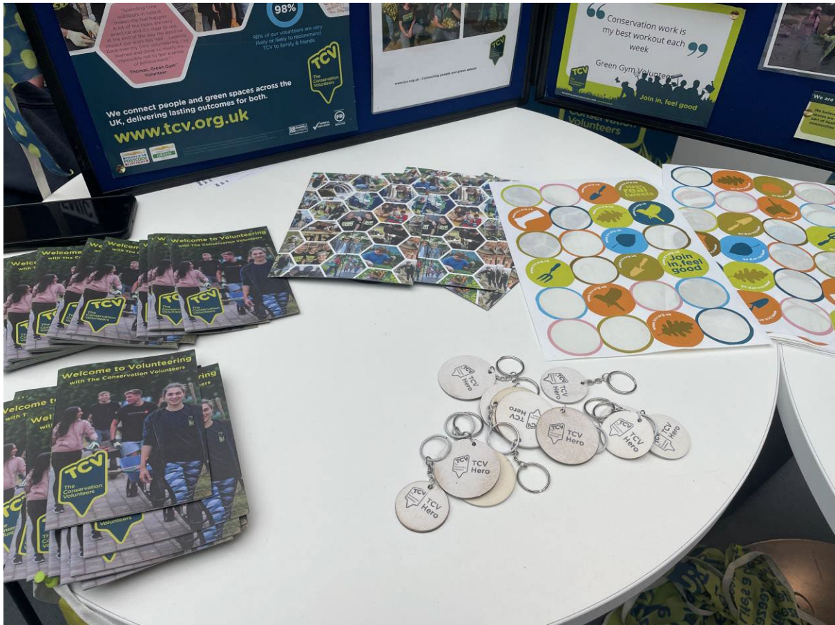
13 - Paper stickers